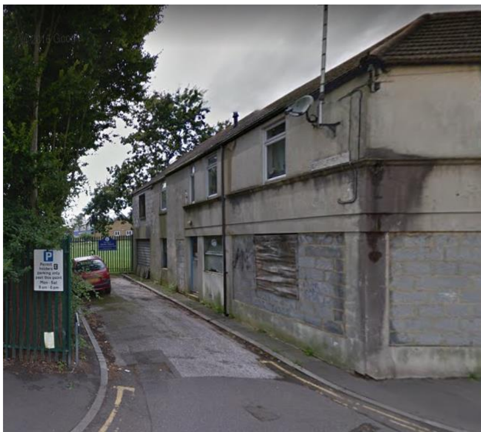
15 Darlington Street Folkestone in 2018