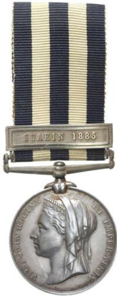
Suakin 85 Medal