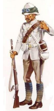
Camel Cavalry Uniform