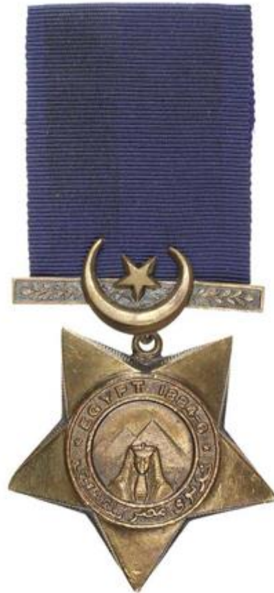
Khedive's Star 1884-6