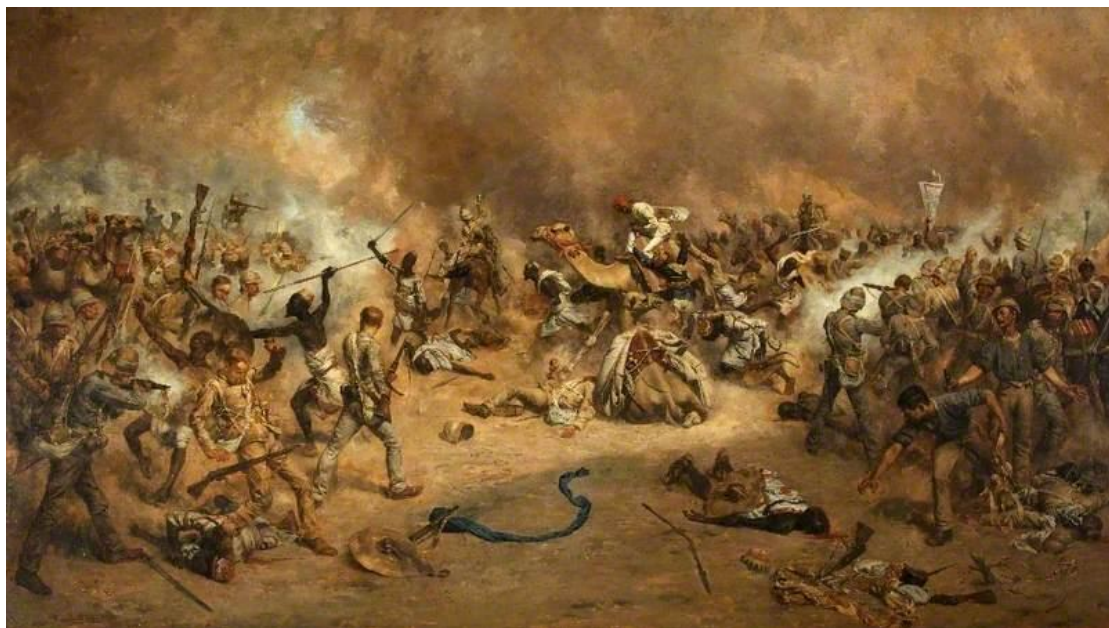
Battle of Tofrek 20 th Hussars.